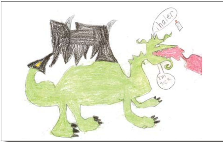
Grade level 1-6: 1st Place, Billy Pham