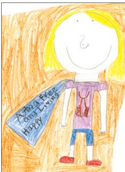
Grade level 1-6: 3rd Place, D'nai Massey